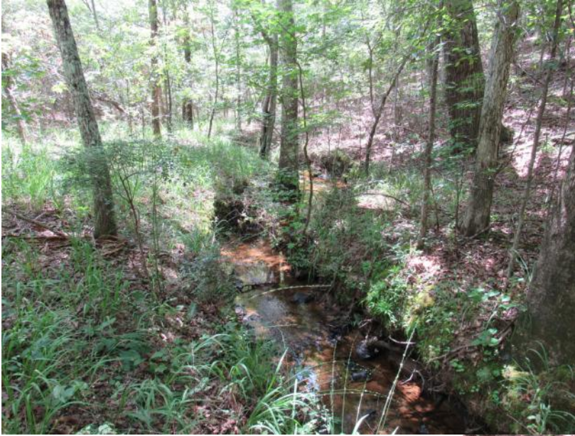
WATER ON THE PROPERTY