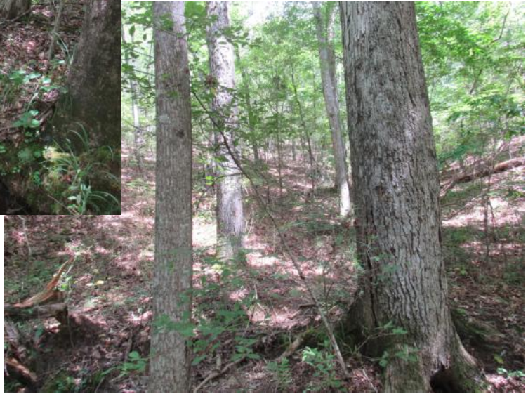
LARGE MATURE RED OAKS AND WHITE OAKS